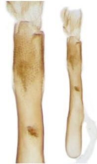
072 Eulemma ostrina (Purple Marbled)