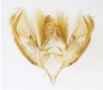
050 Setina irrorella (Dew Moth)