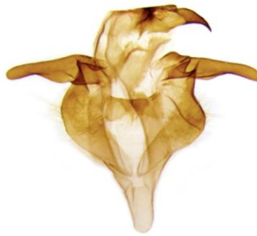
010 Lymantria monacha (Black Arches)