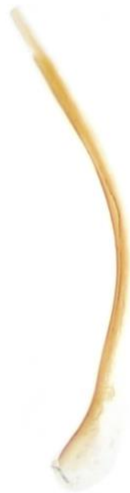
061 Schrankia costaestrigalis (Pinion-streaked Snout)