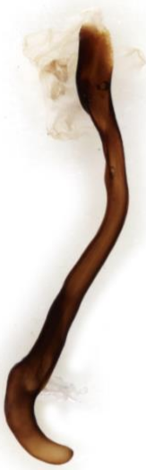
076 Catocala fraxini (Clifden Nonpareil)