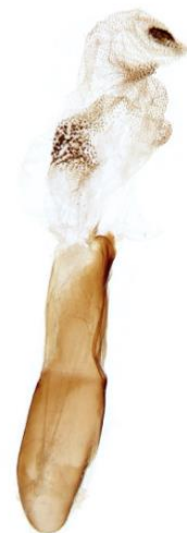
030 Euplagia quadripunctaria (Jersey Tiger)