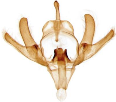
001 Scoliopteryx libatrix (Herald)