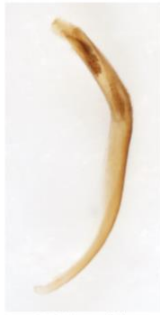
052 Macrochilo cribrumalis (Dotted Fan-foot)