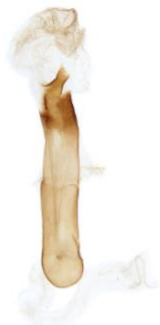
020 Spilosoma lubricipeda (White Ermine)