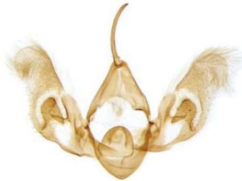
072 Eublemma ostrina (Purple Marbled)