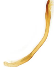
082 Catocala promissa (Light Crimson Underwing)