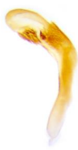
004 Hypena rostralis (Buttoned Snout)