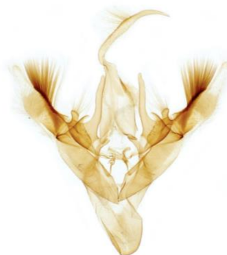
061 Schrankia costaestrigalis (Pinion-streaked Snout)