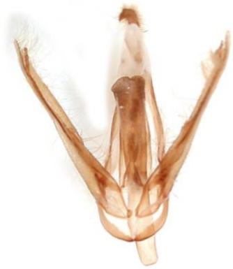
063 Lygephila pastinum (Blackneck)