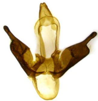
021 Spilosoma urticae (Water Ermine)