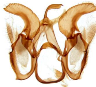
034 Utetheisa pulchella (Crimson Speckled)