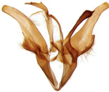
083 Euclidia glyphica (Burnet Companion)