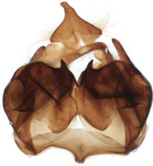
009 Leucoma salicis (White Satin Moth)