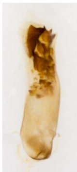
050 Setina irrorella (Dew Moth)