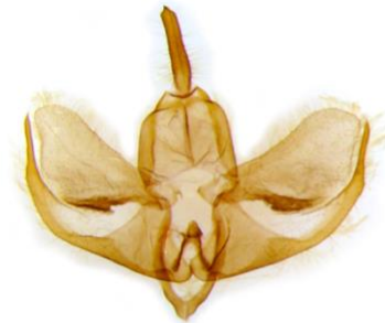
038 Cybosia mesomella (Four-dotted Footman)