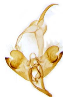
040 Pelosia obtusa (Small Dotted Footman)