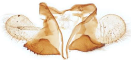
015 Calliteara pudibunda (Pale Tussock)