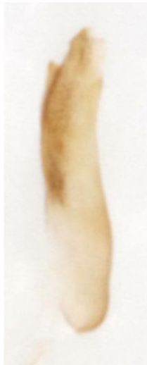
060 Hypenodes humidalis (Marsh Oblique-barred)