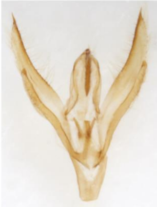
052 Macrochilo cribrumalis (Dotted Fan-foot)