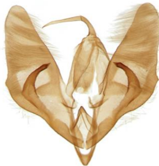
067 Phytometra viridaria (Small Purple-barred)