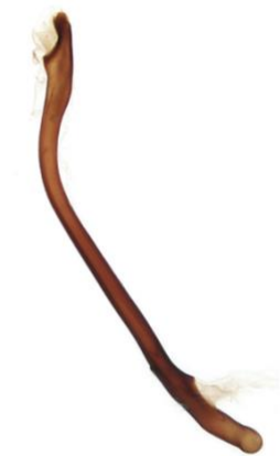
078 Catocala nupta (Red Underwing)