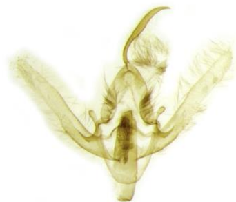
060 Hyphenodes humidalis (Marsh Oblique-barred)