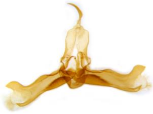
035 Miltochrista miniata (Rosy Footman)