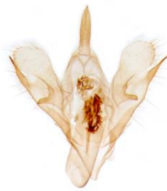
037 Thumatha senex (Round-winged Muslin)