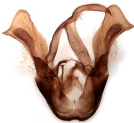
029 Callimorpha dominula (Scarlet Tiger)