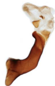
027 Arctia villica (Cream-spot Tiger)