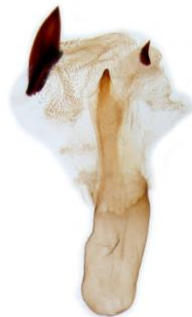
047 Eilema caniola (Hoary Footman)