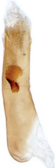
032 Coscinia cribraria (Speckled Footman)