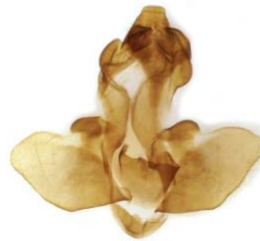
016 Dicallopera fascellina (Dark Tussock)