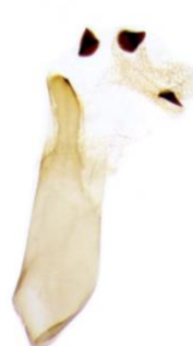
048 Eilema pygmaeola (Pigmy Footman)