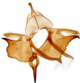
044 Eilema griseola (Dingy Footman)