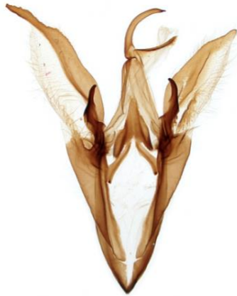
078 Catocala nupta (Red Underwing)