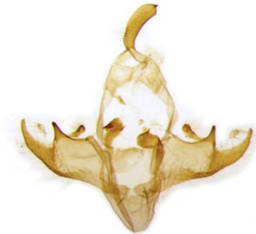
066 Parascotia fuliginaria (Waved Black)