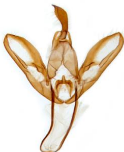
047 Eilema caniola (Hoary Footman)