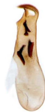
049 Eilema sororcula (Orange Footman)