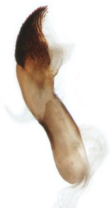
025 Parasemia plantaginis (Wood Tiger)