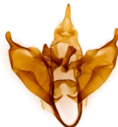
026 Arctia caja (Garden Tiger)