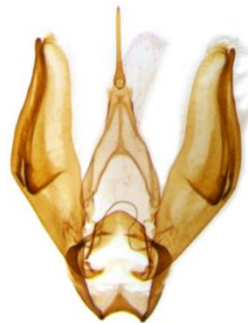
039 Pelosia muscerda (Dotted Footman)