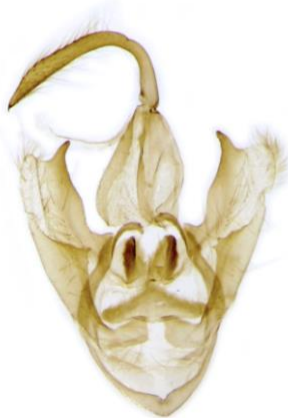
055 Herminia grisealis (Small Fan-foot)