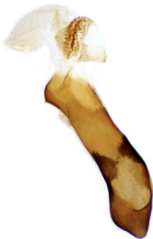
031 Tyria jacobaea (Cinnabar)