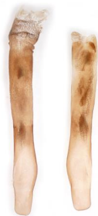
063 Lygephila pastinum (Blackneck)