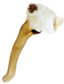
019 Spilosoma lutea (Buff Ermine)