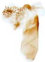
002 Rivula sericealis (Straw Dot)