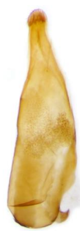
039 Pelosia muscerda (Dotted Footman)