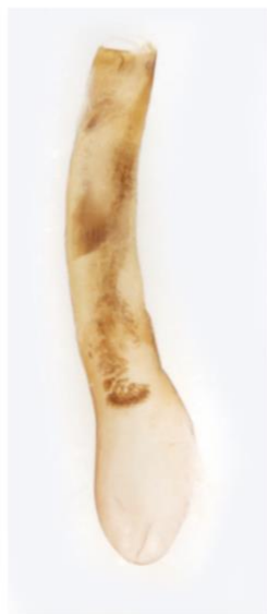
084 Callistege mi (Mother Shipton)