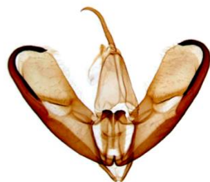
049 Eilema sororcula (Orange Footman)