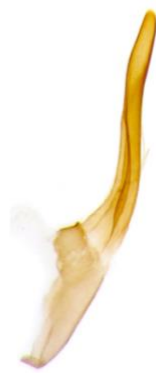
010 Lymantria monacha (Black Arches)