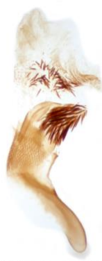
003 Hypena proboscidalis (Snout)