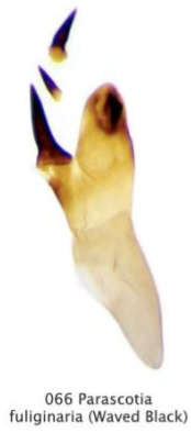
066 Parascotia fuliginaria (Waved Black)