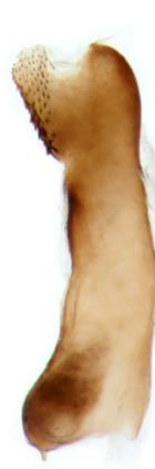
012 Euproctis chrysorrhoea (Brown-tail)