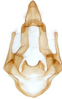
020 Spilosoma lubricipeda (White Ermine)