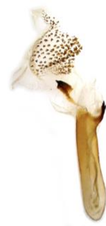
024 Phragmatobia fuliginosa (Ruby Tiger)