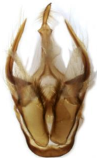
030 Euplagia quadripunctaria (Jersey Tiger)