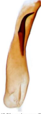
043 Eilema depressa (Buff Footman)