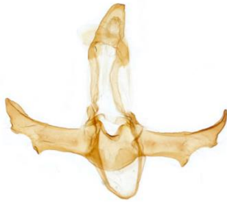
019 Spilosoma lutea (Buff Ermine)