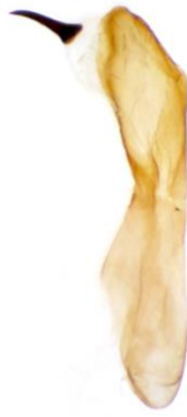
041 Lithosia quadra (Four-spotted Footman)