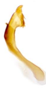
007 Hypena crassalis (Beautiful Snout)