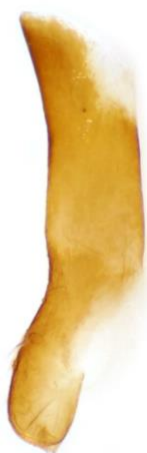
016 Dicallomera fascellina (Dark Tussock)