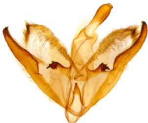
041 Lithosia quadra (Four-spotted Footman)