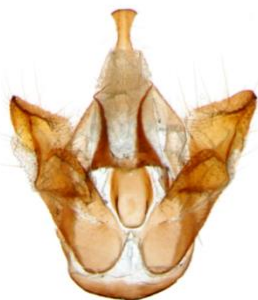
032 Coscinia cribraria (Speckled Footman)