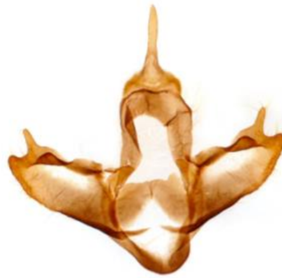
023 Diacrisia sannio (Clouded Buff)