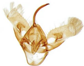
073 Eublemma parva (Small Marbled)