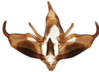
025 Parasemia plantaginis (Wood Tiger)