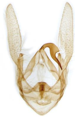
054 Herminia tarsicrinalis (Shaded Fan-foot)