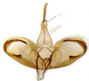
045 Eilema lurideola (Common Footman)