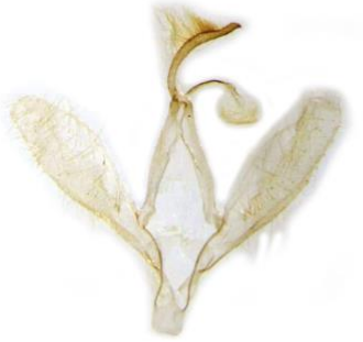
002 Rivula sericealis (Straw Dot)