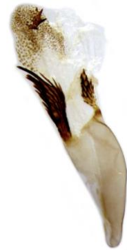
057 Pechipogo plumigeralis (Plumed Fan-foot)