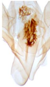
037 Thumatha senex (Round-winged Muslin)