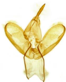
046 Eilema complana (Scarce Footman)