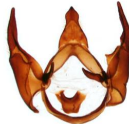
027 Arctia villica (Cream-spot Tiger)