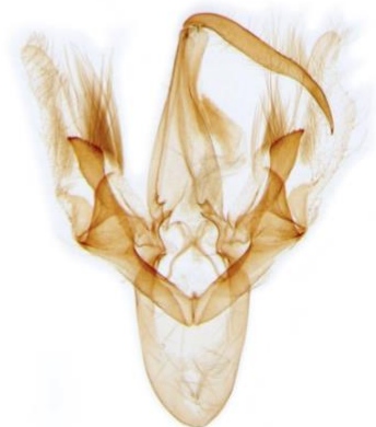
062 Schrankia taenialis (White-lined Snout)