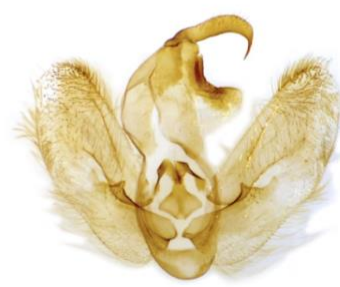
007 Hypena crassalis (Beautiful Snout)