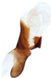
009 Leucoma salicis (White Satin Moth)