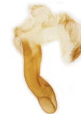
026 Arctia caja (Garden Tiger)