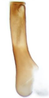
067 Phytometra viridaria (Small Purple-barred)