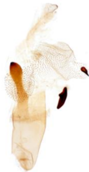
046 Eilema complana (Scarce Footman)