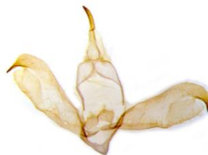
036 Nudaria mundana (Muslin Footman)