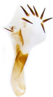
035 Miltochrista miniata (Rosy Footman)