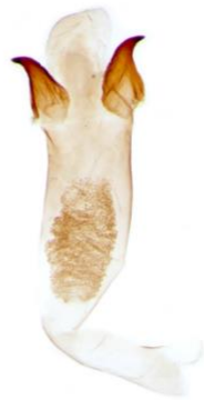
036 Nudaria mundana (Muslin Footman)