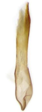
069 Laspeyria flexula (Beautiful Hook-tip)