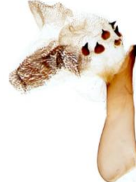
044 Eilema griseola (Dingy Footman)