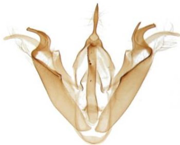
070 Tristaeles emortualis (Olive Crescent)