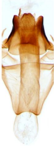
001 Scoliopteryx libatrix (Herald)