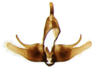
017 Orgyia antiqua (Vapourer)