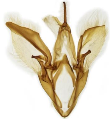
079 Catocala electa (Rosy Underwing)