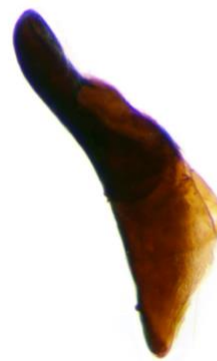
017 Orgyia antiqua (Vapourer)