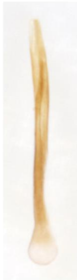
062 Schrankia taenialis (White-lined Snout)