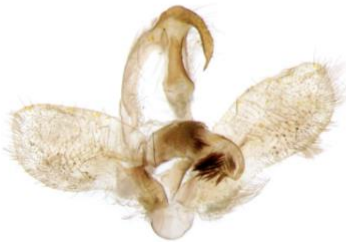
003 Hypena proboscidalis (Snout)