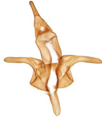
011 Lymantria dispar (Gypsy Moth)