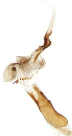
034 Utetheisa pulchella (Crimson Speckled)