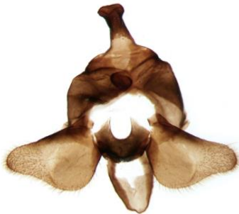
012 Euproctis chrysorrhoea (Brown-tail)