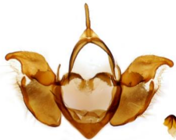
031 Tyria jacobaea (Cinnabar)