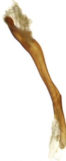
079 Catocala electa (Rosy Underwing)