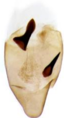
045 Eilema lurideola (Common Footman)