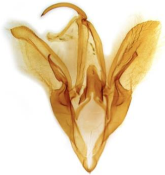
082 Catocala promissa (Light Crimson Underwing)