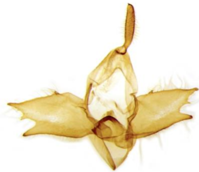
053 Herminia tarsipennalis (Fan-foot)