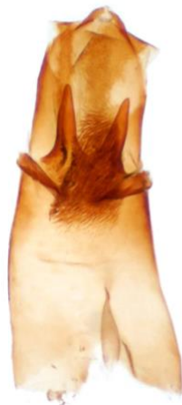
015 Calliteara pudibunda (Pale Tussock)