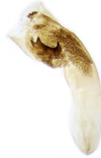
055 Herminia grisealis (Small Fan-foot)