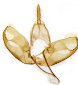
048 Eilema pygmaeola (Pigmy Footman)