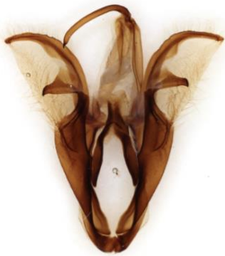
076 Catocala fraxini (Clifden Nonpareil)