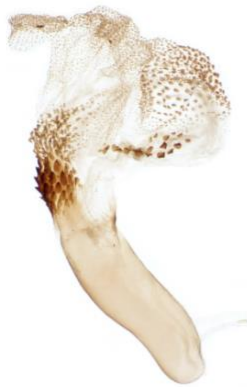
053 Herminia tarsipennalis (Fan-foot)