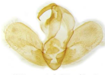
004 Hypena rostralis (Buttoned Snout)