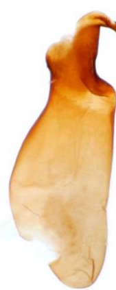
013 Euproctis similis (Yellow-tail)