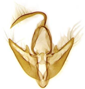
069 Laspeyria flexula (Beautiful Hook-tip)