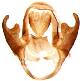
022 Diaphora mendica (Muslin Moth)