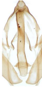
070 Tristaeles emortualis (Olive Crescent)