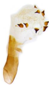
038 Cybosia mesomella (Four-dotted Footman)