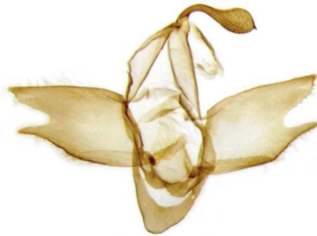
057 Pechipogo plumigeralis (Plumed Fan-foot)