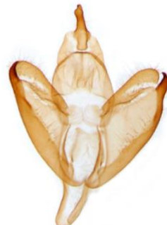
043 Eilema depressa (Buff Footman)