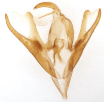
084 Callistege mi (Mother Shipton)