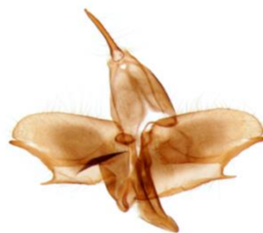
042 Atolmis rubricollis (Red-necked Footman)