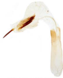
225 Dryobotodes eremita (Brindled Green)