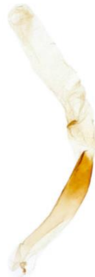
254 Cerapteryx graminis (Antler Moth)