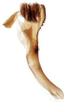
335 Diarsia florida (Fen Square-spot)