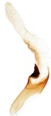
252 Tholera cespitis (Hedge Rustic)