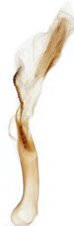
367 Protolampra sobrina (Cousin German)