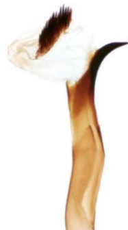
273 Hada plebeja (Shears)