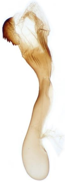
169 Mesapamea secalis (Common Rustic)