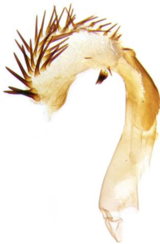
059 Calophasia lunula (Toadflax Brocade)