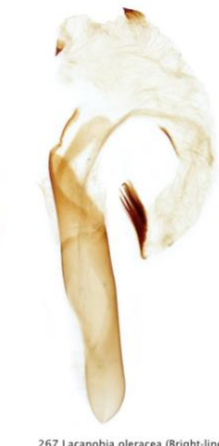
267 Lacanobia oleracea (Bright-line Brown-eye)