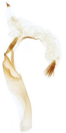
265 Lacanobia contigua (Beautiful Brocade)