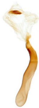
230 Aporophya australis (Feathered Brindle)