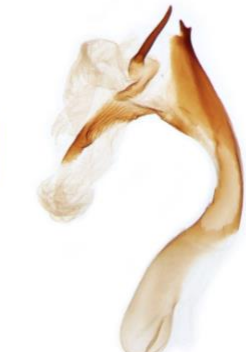
280 Hecatera disodea (Small Ranunculus)