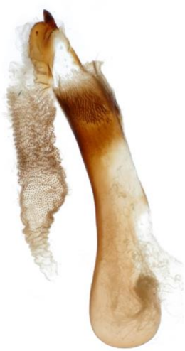
021 Syngrapha interrogationis (Scarce Silver Y)