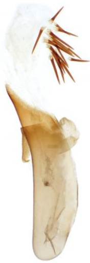
065 Asteroscopus sphinx (Sprawler)