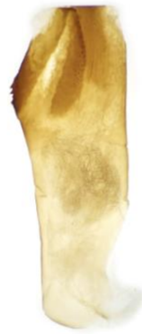
344 Noctua orbona (Lunar Yellow Underwing)