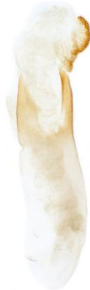
325 Agrotis puta (Shuttle-shaped Dart)