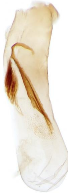
171 Litoligia literosa (Rosy Minor)