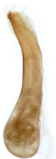
299 Mythimna litoralis (Shore Wainscot)