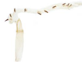
076 Helicoverpa armigera (Scarce Bordered Straw)