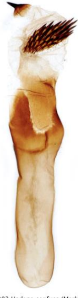
283 Hadena confusa (Marbled Coronet)