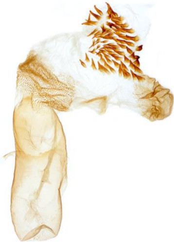
038 Acronicta psi (Grey Dagger)