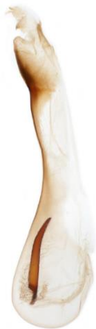
018 Autographa bractea (Gold Spangle)