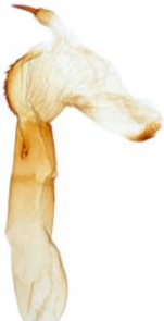
118 Celena haworthii (Haworth's Minor)