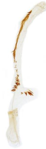
296 Mythimna unipuncta (White-speck)