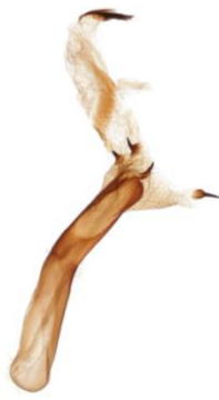
251 Egira conspiciaris (Silver Cloud)