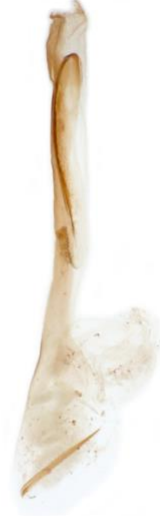
003 Trichoplusia ni (Ni Moth)