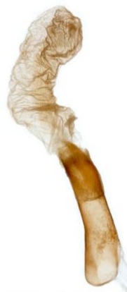
207 Xylena solidaginis (Goldenrod Brindle)