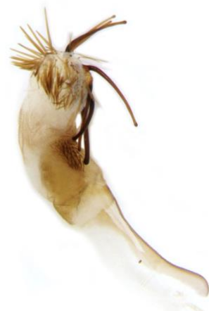
064 Amphipyra tragopoginis (Mouse Moth)