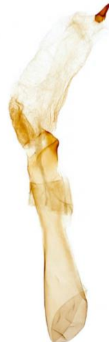
023 Plusia putnami (Lempke's Gold Spot)