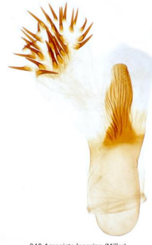
040 Acronicta leporina (Miller)