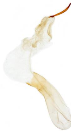
188 Anchoscelis helvola (Flounced Chestnut)