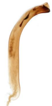
250 Anorthoa munda (Twin-spotted Quaker)