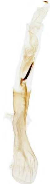
304 Leucania loreyi (Cosmopolitan)