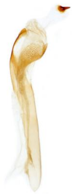
241 Panolis flammea (Pine Beauty)