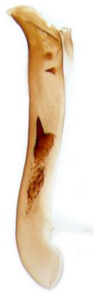
180 Tiliacea aurago (Barred Sallow)