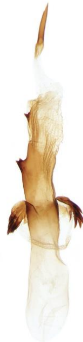
176 Oligia fasciuncula (Middle-barred Minor)