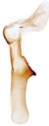
356 Xestia agathina (Heath Rustic)