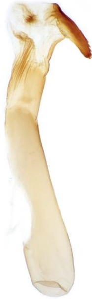
170 Mesapamea didyma (Lesser Common Rustic)