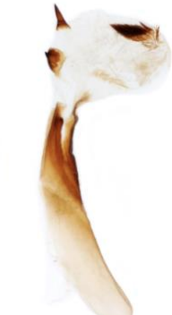
281 Hadena bicruris (Lychnis)