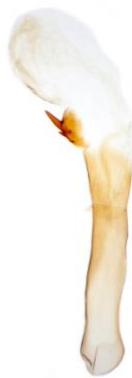
221 Parastictis suspecta (Suspected)