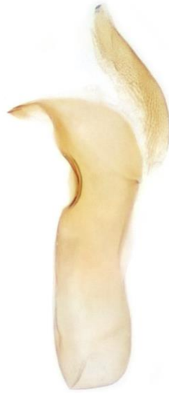
027 Deltote bankiana (Silver Barred)