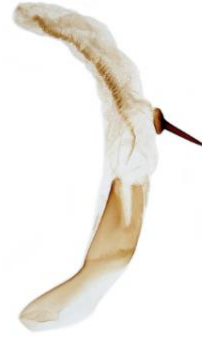
336 Cerastis rubricosa (Red Chestnut)