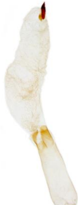
181 Xanthia togata (Pink-barred Sallow)