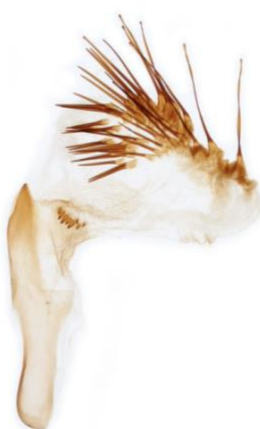
063 Amphipyra berbera (Svensson's Copper Underwing)