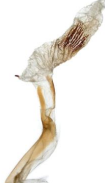
345 Noctua comes (Lesser Yellow Underwing)