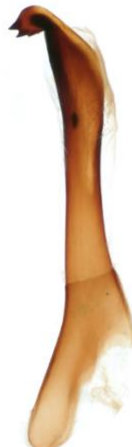
134 Rhizodra lutoxa (Large Wainscot)