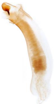
113 Phlogophora meticulosa (Angle Shades)