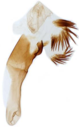
001 Abrostola tripartita (Spectacle)