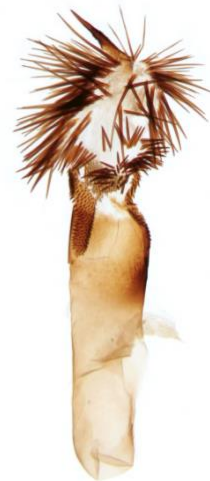
069 Xylocampa areola (Early Grey)