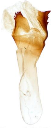
155 Apamea epomidion (Clouded Brindie)