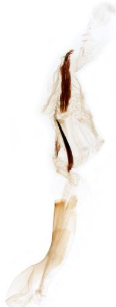
302 Leucania obsoleta (Obscure Wainscot)