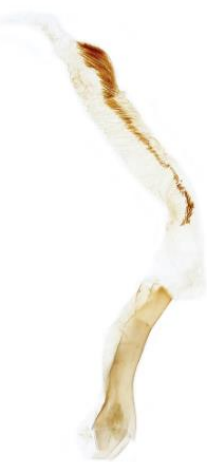
293 Mythimna impura (Smoky Wainscot)