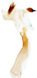
233 Aporophya nigra (Black Rustic)