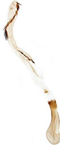
289 Mythimna pudorina (Striped Wainscot)