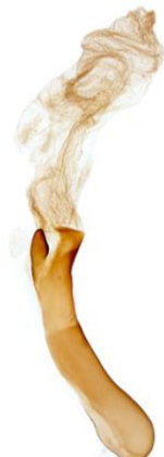
186 Agrochola lychnidis (Beaded Chestnut)