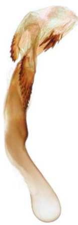
132 Luperina nickerli (Sandhill Rustic)