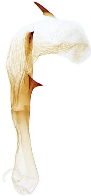
174 Oligia latrucula (Tawny Marbled Minor)