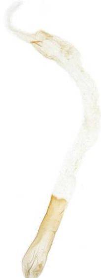
298 Mythimna ferrago (Clay)