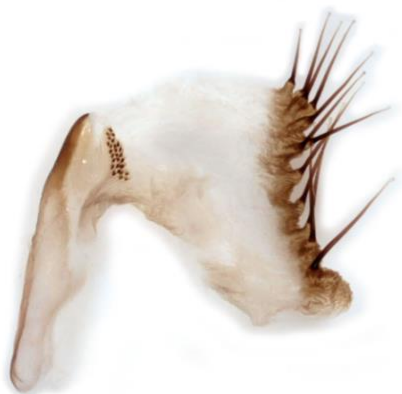
062 Amphipyra pyramidea (Copper Underwing)