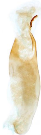
322 Agrotis vestigialis (Archer's Dart)