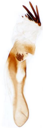
034 Moma alpinum (Scarce Merveille du jour)