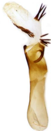
002 Abrostola triplasia (Dark Spectacle)