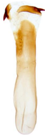
211 Enargia paleacea (Angle-striped Sallow)