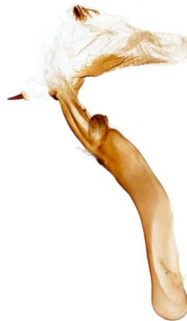
125 Hydraecia osseola (Marsh Mallow Moth)