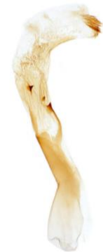
245 Orthosia cruda (Small Quaker)