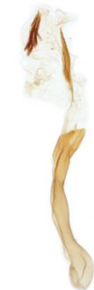
261 Polia nebulosa (Grey Arches)