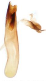
223 Dryobota labecula (Dak Rustic)