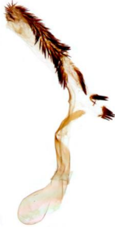
097 Hoplodrina blanda (Rustic)