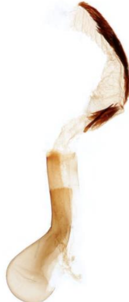
303 Leucania putrescens (Devonshire Wainscot)