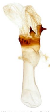
158 Apamea sordens (Rustic Shoulder-knot)