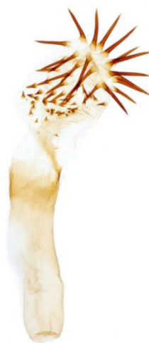
046 Subacronicta megacephala (Poplar Grey)