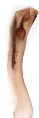
148 Photodes morrisii (Morris's Wainscot)