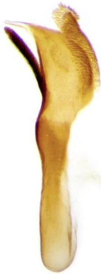
026 Deltote uncula (Silver Hook)