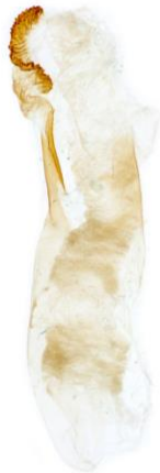
317 Agrotis exclamations (Heart and Dart)