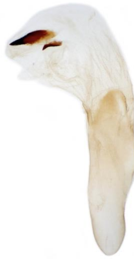
085 Bryopsis muralis (Marbled Green)