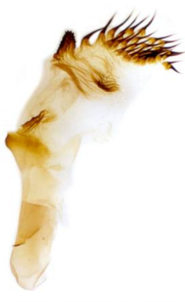
045 Acronicta rumicis (Knot Grass)