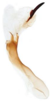
119 Helotropha leucostigma (Crescent)