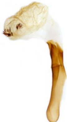
202 Lithophane ornitopus (Grey Shoulder-knot)