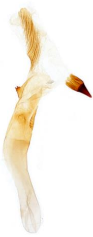
123 Hydraecia micacea (Rosy Rustic)