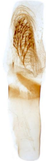
036 Acronicta alni (Alder Moth)