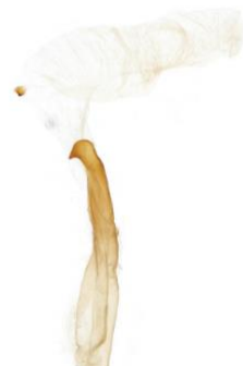
274 Mamestra brassicae (Cabbage Moth)