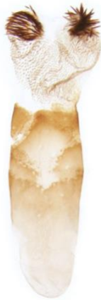
032 Colocasia coryli (Nut-tree Tussock)