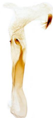
243 Orthosia miniosia (Blossom Underwing)