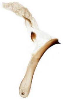
271 Ceramica pisi (Broom Moth)