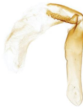
352 Anaplectoides prasina (Green Arches)