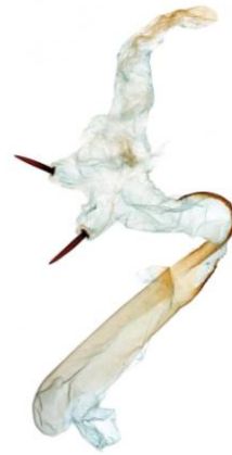
055 Cucullia asteris (Star-wort)