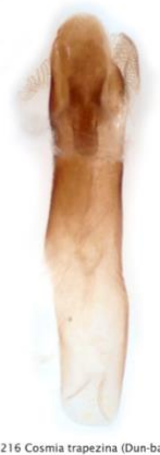
216 Cosmia trapezina (Dun-bar)