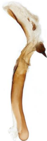
124 Hydraecia petasitis (Butterbur)