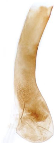
297 Mythimna albipuncta (White Point)