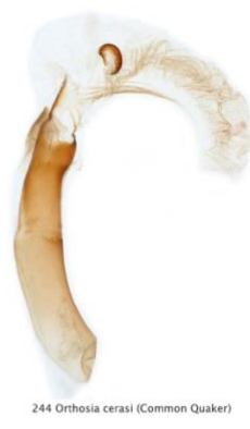
244 Orthosia cerasi (Common Quaker)