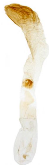
047 Craniophora ligustri (Coronet)