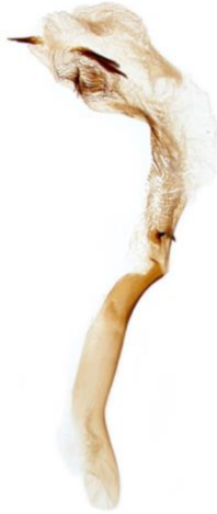
210 Eupsilia transversa (Satellite)