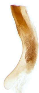
100 Chilodes maritima (Silky Wainscot)