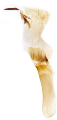
193 Sunira lunosa (Lunar Underwing)