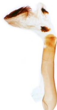
232 Aporophya lunenburgensis (Deep-brown Dart)