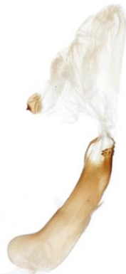
347 Noctua janthina (Langmaid's Yellow Underwing)