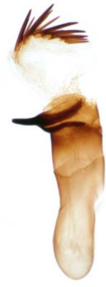
137 Arenostola phragmitidis (Fen Wainscot)