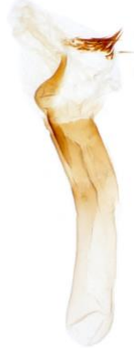
129 Amphipoea crinanensis