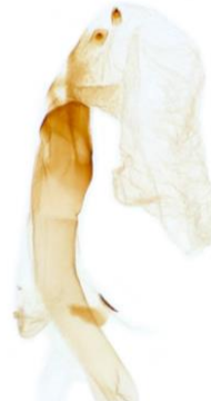
164 Apamea sublustris (Reddish Light Arches)