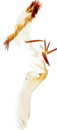
099 Hoplodrina ambigua (Vine's Rustic)