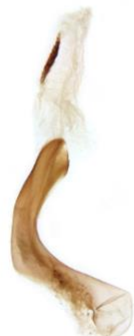
272 Papestra biren (Glaucous Shears)