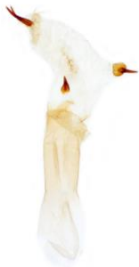
178 Leucochaena oditis (Beautiful Gothic)