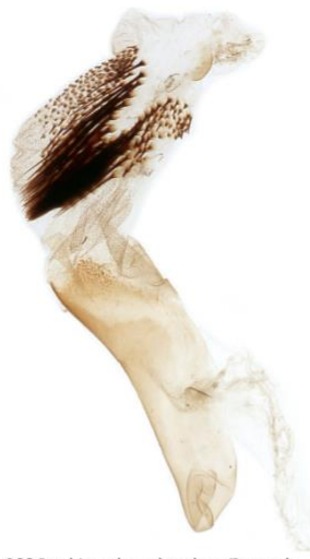
066 Brachionycha nubeculosa (Rannoch Sprawler)