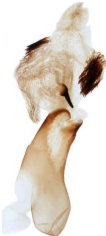
209 Xylena vetusta (Red Sword-grass)