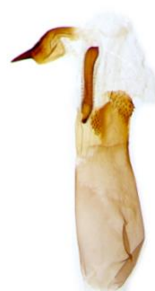
104 Athetis hospes (Porter's Rustic)