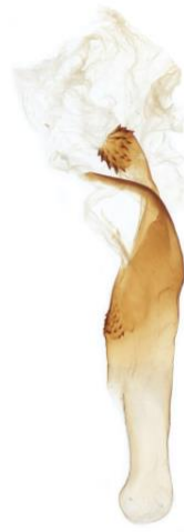
342 Noctua pronubana (Large Yellow Underwing)