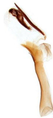
1931 Spudaea ruticilla (Scarce Chestnut)