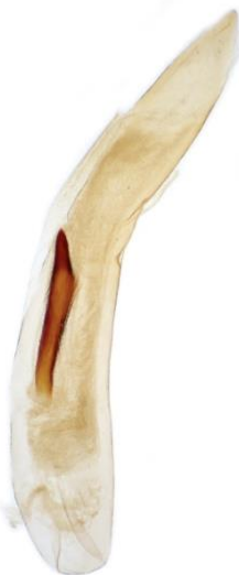
082 Cryphia algae (Tree-lichen Beauty)