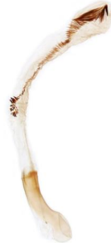
291 Mythimna pallens (Common Wainscot)