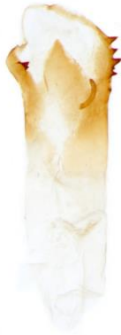
217 Cosmia pyralina (Lunar-spotted Pinion)