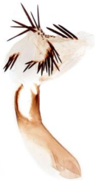
105 Dypterygia scabriuscula (Bird's Wing)