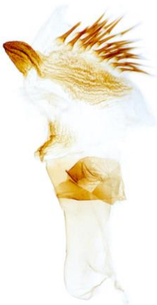
042 Acronicta menyanthidis (Light Knot-grass)