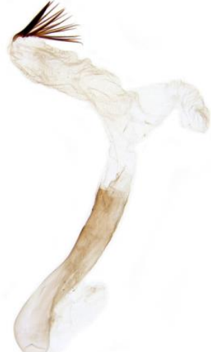
300 Mythimna l-album (L-album Wainscot)