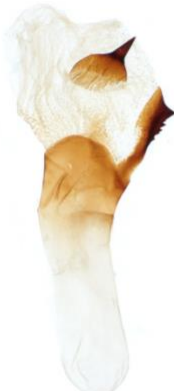
157 Apamea anceps (Large Nutmeg)