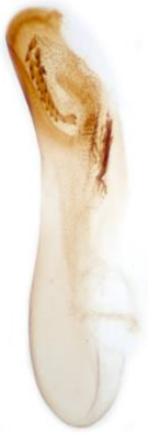
144 Denticucullus pygmina (Small Wainscot)