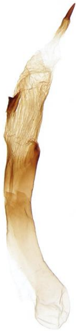
173 Oligia strigilis (Marbled Minor)