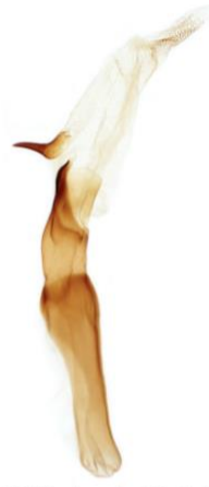
270 Melanchra persicaria (Dot Moth)