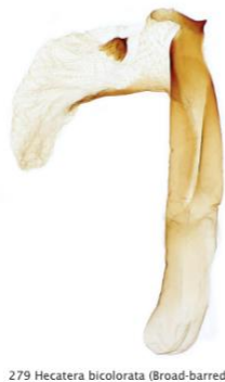
279 Hecatera bicolorata (Broad-barred White)