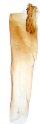
142 Coenobia rufa (Small Rufous)