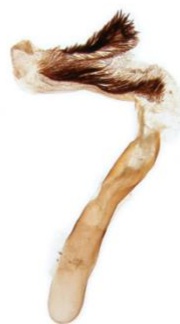
102 Rusina ferruginea (Brown Rustic)