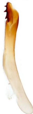
136 Nonagriia typhae (Bulrush Wainscot)