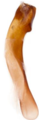
165 Apamea furva (Confused)