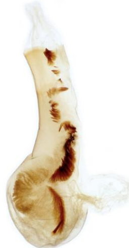
295 Mythimna vitellina (Delicate)