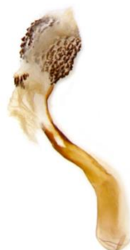
093 Caradrina kadenii (Clancy's Rustic)