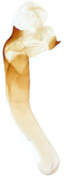
161 Apamea oblonga (Crescent Striped)