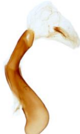
236 Polymixis xanthomista (Black-banded)