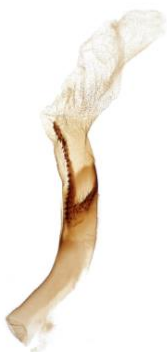
276 Sideridis rivularis (Campion)