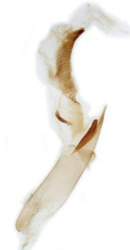
075 Heliethis nubigera (Eastern Bordered Straw)