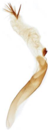
266 Lacanobia susa (Dog's Tooth)