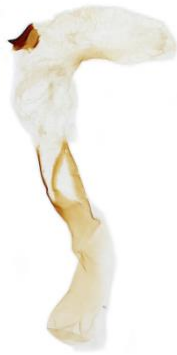
353 Xestia baja (Dotted Clay)