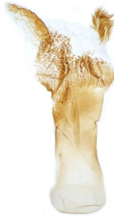
033 Diloba caeruleocephala (Figure-of- eight)