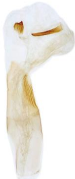
070 Pyrrhia umbra (Bordered Sallow)