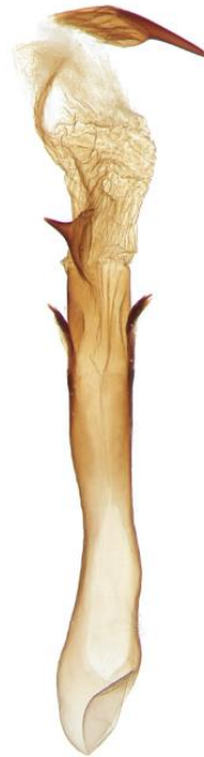
175 Oligia versicolor (Rufous Minor)