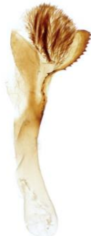
334 Diarsia rubi (Small Square-spot)