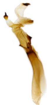
247 Orthosia gracilis (Powdered Quaker)