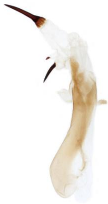
052 Cucullia umbratica (Shark)