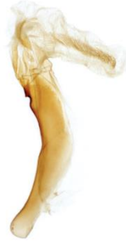
360 Xestia ditrapezium (Triple-spotted Clay)