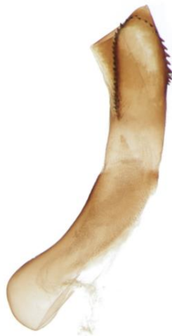
338 Lycophotia porphyrea (True Lover's Knot)