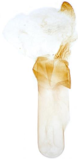
035 Simyra albovenosa (Reed Dagger)