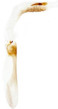
015 Autographa gamma (Silver Y)