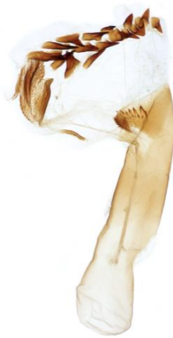
068 Allophyes oxyacanthae (Green- brindled Crescent)