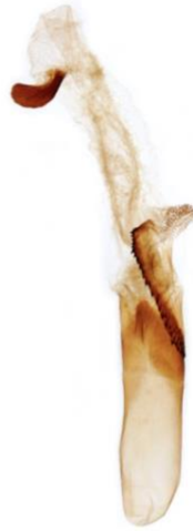
341 Standfussiana lucernea (Northern Rustic)