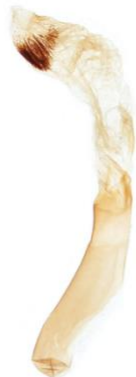
107 Mormo maura (Old Lady)