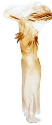
168 Lateroligia ophiogramma (Double Lobed)