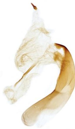
263 Lacanobia w-latinum (Light Brocade)