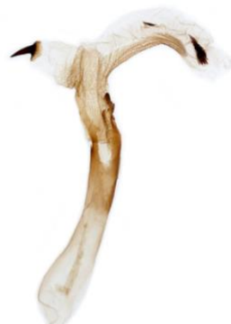
248 Orthosia opima (Northern Drab)