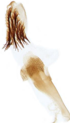
061 Stilbia anomola (Anomalous)