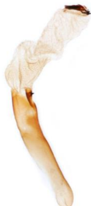
253 Tholera decimilis (Feathered Gothic)