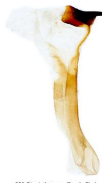
332 Diarsia brunnea (Purple Clay)