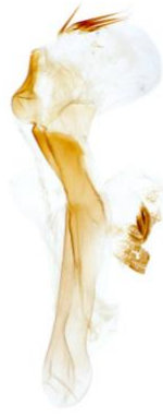
127 Amphipoea lucens (Large Ear)