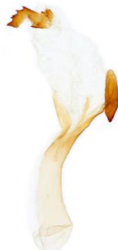
331 Diarsia dahlii (Barred Chestnut)