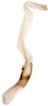
307 Peridroma saucia (Pearly Underwing)