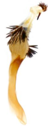
189 Leptoligia lota (Red-lined Quaker)