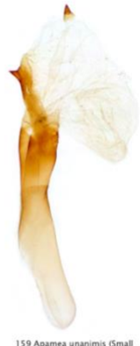
159 Apamea unanimis (Small Clouded Brindie)