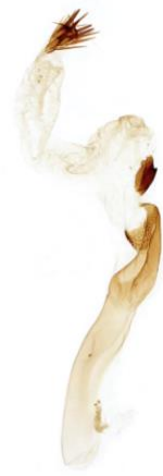
264 Lacanobia thalassina (Pale-shouldered Brocade)