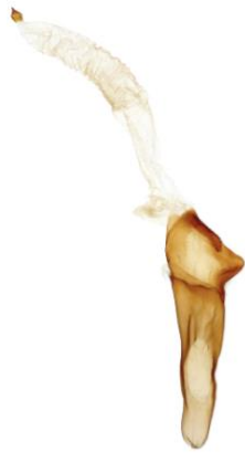
255 Anarta trifolii (Nutmeg)