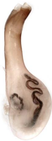
288 Mythimna turca (Double Line)