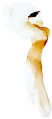
126 Amphipoea fucosa (Saltern Ear)