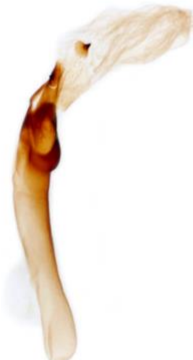
162 Apamea monoglypha (Dark Arches)