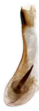
017 Autographa jota (Plain Golden Y)