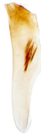
212 Ipimorpha retusa (Double Kidney)