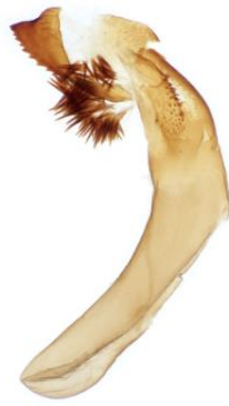
333 Diarsia mendica (Ingrailed Clay)