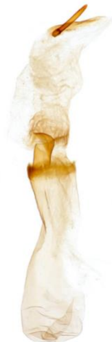
022 Plusia festucae (Gold Spot)