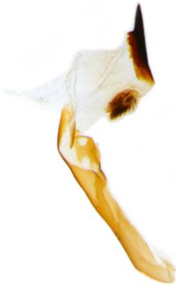
087 Spodoptera exigua (Small Mottled Willow)