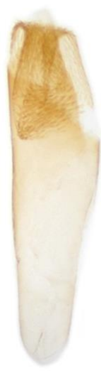
084 Bryophila domestica (Marbled Beauty)