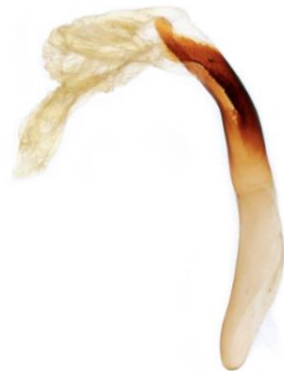
343 Noctua fimbriata (Broad-bordered Yellow Underwing)