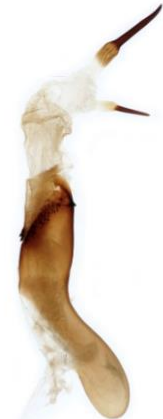
058 Cucullia verbasci (Mullein)