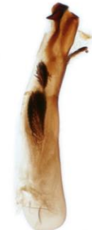
101 Carancya trigrammica (Treble Lines)