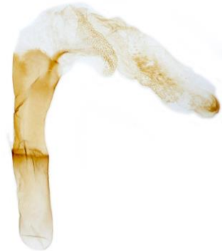
092 Caradrina morpheus (Mottled Rustic)