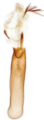
192 Sunira circellaris (Brick)