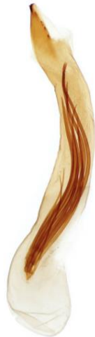
337 Cerastis leucographa (White-marked)