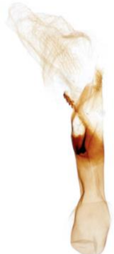
357 Xestia xanthographa (Square-spot Rustic)