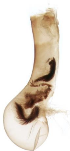
290 Mythimna conigera (Brown-line Bright-eye)