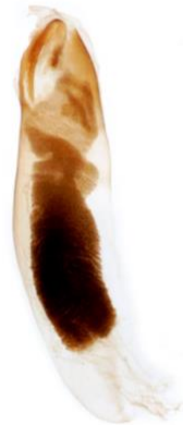
324 Agrotis trux (Crescent Dart)