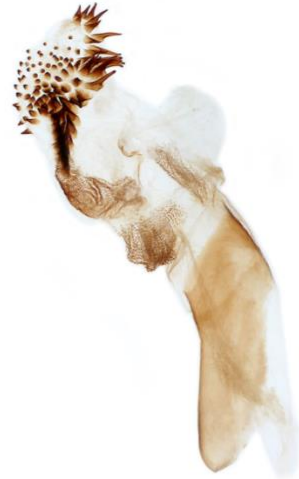
037 Acronicta tridens (Dark Dagger)