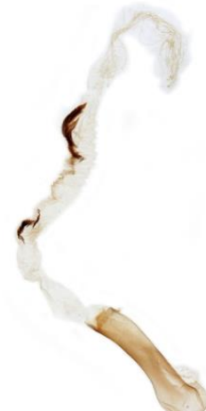
294 Mythimna straminea (Southern Wainscot)