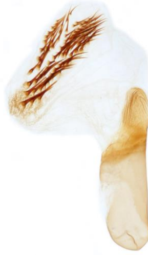
039 Acronicta aceris (Sycamore)