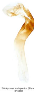
160 Apamea scolapacina (Slender Brindie)