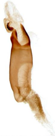
319 Agrotis segetum (Turnip Moth)