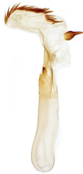
286 Hadena perplexa (Tawny Shears)