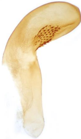
031 Tyta luctuosa (Four-spotted)