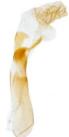
235 Polymixis lichenea (Feathered Ranunculus)