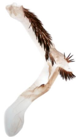
096 Hoplodrina octogenaria (Uncertain)