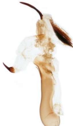
184 Cirrha ocellaris (Pale Lemon Sallow)