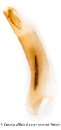
215 Cosmia affinis (Lesser-spotted Pinion)