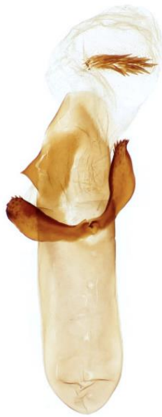
284 Hadena albimacula (White Spot)