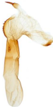
121 Cortyna flavago (Frosted Orange)