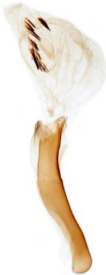
201 Lithophane socia (Pale Pinion)