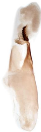
320 Agrotis clavus (Heart and Club)