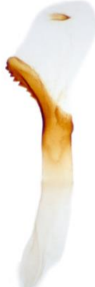
141 Archanara dissoluta (Brown-veined Wainscot)