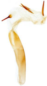
194 Conistra vaccinii (Chestnut)