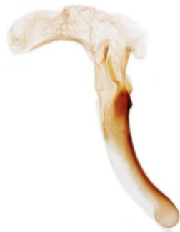
359 Xestia c-nigrum (Setaceous Hebrew Character)