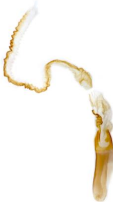
327 Agrotis ipsilon (Dark Sword-grass)