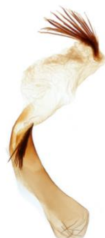
237 Polymixis flavocincta (Large Ranunculus)