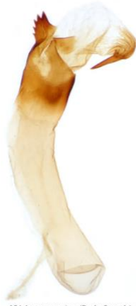
154 Apamea remissa (Dusky Brocade)