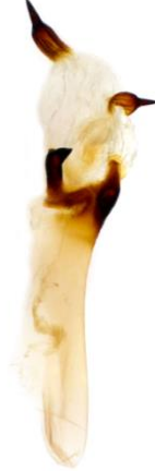
156 Apamea crenata (Clouded-bordered Brindie)