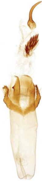
282 Hadena compta (Varied Coronet)