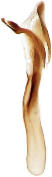
024 Protodeltote pygarga (Marbled White-spot)