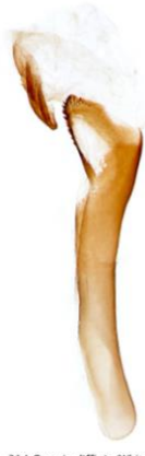
214 Cosmia diffinis (White-spotted Pinion)