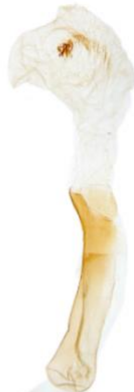
206 Lithophane leautieri (Blair's Shoulder-knot)