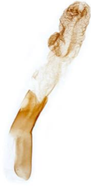
313 Euxoa tritici (White-line Dart)