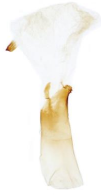
348 Noctua janthe (Lesser Broad-bordered Yellow Underwing)