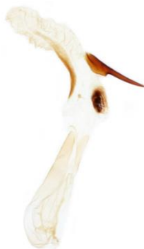
330 Ochropleura leucogaster (Radford's Flame Shoulder)