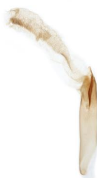
074 Heliethis peltigera (Bordered Straw)