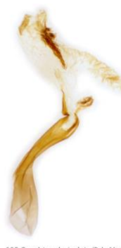
095 Caradrina clavipalpis (Pale Mottled Willow)