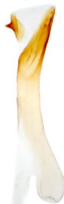
140 Archanara neurica (White-mantled Wainscot)