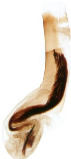
301 Leucania comma (Shoulder-striped Wainscot)