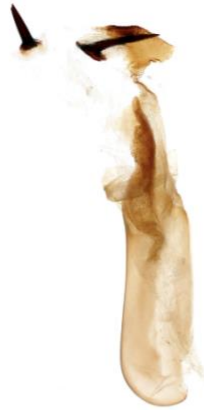
053 Cucullia chamomillae (Chamomile Shark)