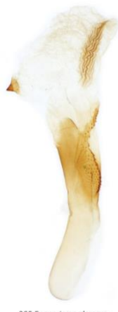
365 Eugnorisma glareosa (Autumnal Rustic)